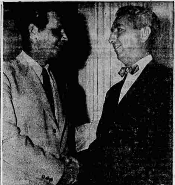
Clark Congratulated—Attorney General Tom Clark (right), President Truman's selection to fill a supreme court vacancy created by the death of Justice Frank Murphy, receives the congratulations of Secretary of Labor Maurice Tobin as both leave the White House after a cabinet meeting.