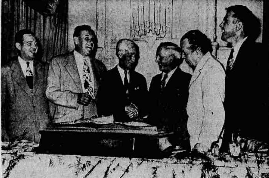
Gar Wood Honored

Silverton Sox Slate Last Home Game Saturday Silverton—The last state league game for the Silverton Red Sox at the home (McGinnis) field, will be with Sweet Home here, Saturday night at 8:30 o'clock. This arrangement has been a switch from the formerly announced play at Sweet Home. The game should be good as Silverton is leading the state league and Sweet Home is in second place.