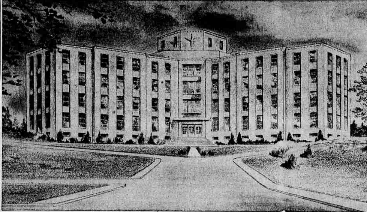
Here is a picture of the new Salem General hospital as it will appear according to present plans. The general public campaign will start with a kick-off dinner Monday night at the Marion hotel attended by all the campaign workers.