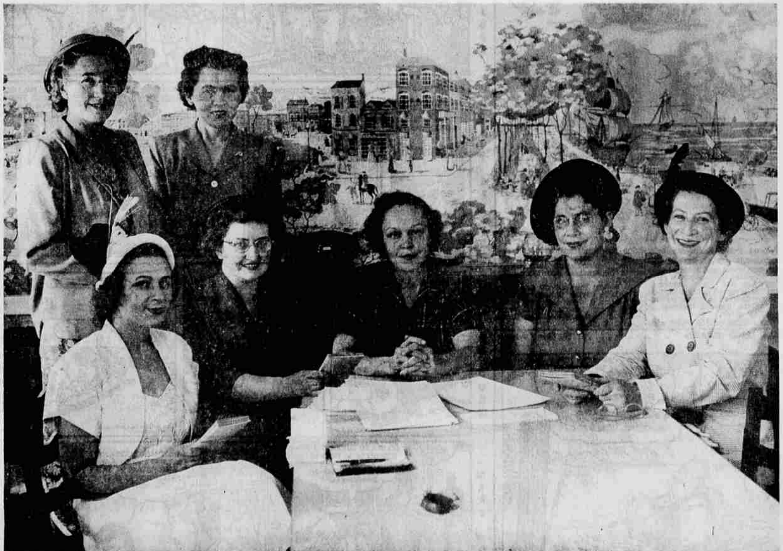
NEXT TUESDAY launches a big job for a large group of Salem women who will handle the residential solicitation for the Salem Hospital Development program. The co-chairmen and their five commanders are picture here at a recent work meeting.