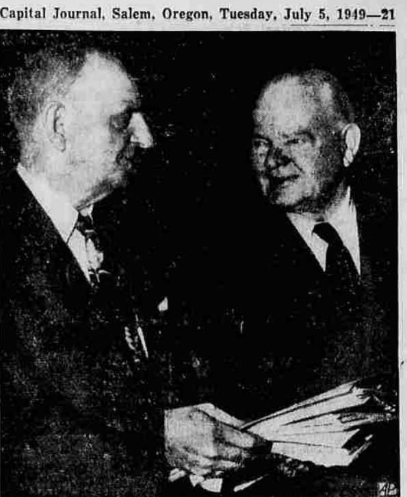
Talks with Chairman—Herbert Hoover (right) talks with Chairman Carl Vinson (D, Ga.), of the house armed services committee before telling the group it would be "dangerous to the country" to create a chairman for the joint chiefs of staff of the armed services as proposed by the Truman administration.

Deaths section listing names of deceased individuals, their ages, and details of their passing.