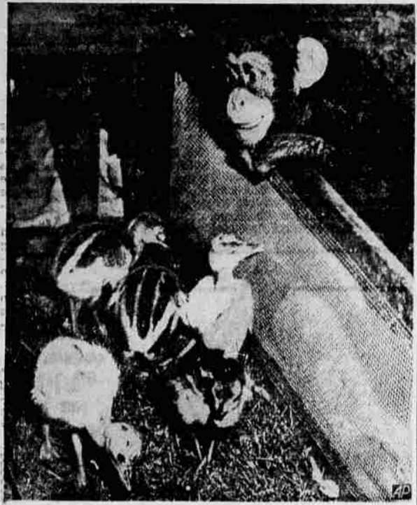
Puzzled Chimp —Pandora, the Philadelphia zoo's chimpanzee, appears slightly puzzled as he looks over six baby rhesus, South American ostriches, which were born at the zoo. The sextuplets were hatched from 16 eggs on which a male ostrich had been sitting for a month. Two of the new arrivals were albino ostriches, zoo officials pointed out.