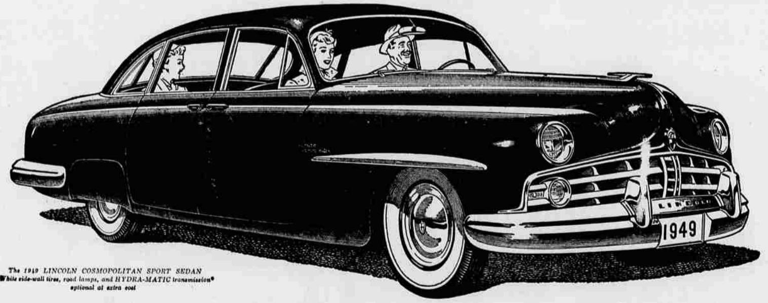
The 1949 LINCOLN COSMOPOLITAN SPORT SEDAN White side-wall tires, roof lamps, and HYDRA-MATIC transmission* optional at extra cost

No gears to shift! No clutch to press! Simple as 1-2-3!