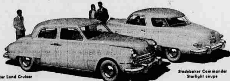
Studebaker Land Cruiser

Yes, Studebaker's business is booming. Stop in for a look. You'll quickly see why.