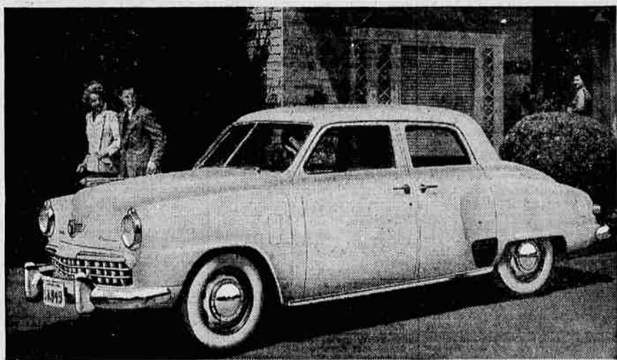
Studebaker Champion 4-door sedan