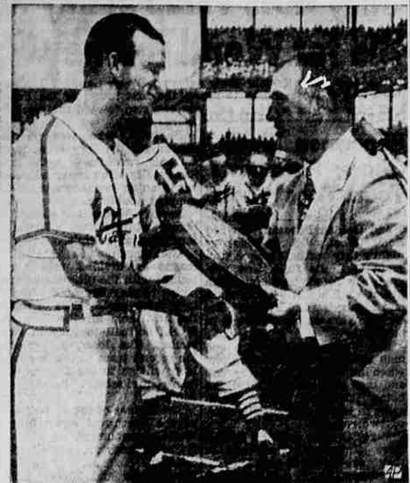
Musial Honored Stan Musial, Cardinals outfielder, is presented with the Most Valuable Player plaque by Commissioner A. B. (Happy) Chandler before a recent Cardinal-Braves game at St. Louis. The award is for 1948, and makes the third time Stan has won the honor.