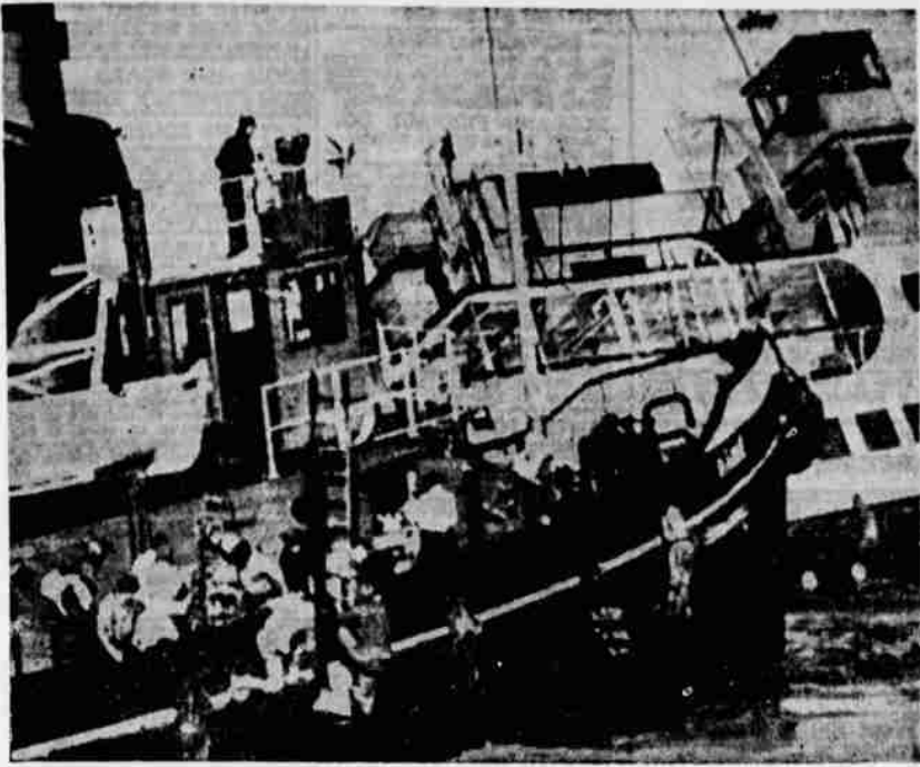
Passenger Ship Hits Mine, Sinks —Survivors of the Belgian passenger ship Princess Astrid, which sank after hitting a mine in the English channel off Dunkerque, France, crowd rescue vessels as they killed alongside the stricken steamer. Five persons were killed and 10 injured among the 283 passengers and crewmen aboard the cross-channel ship.