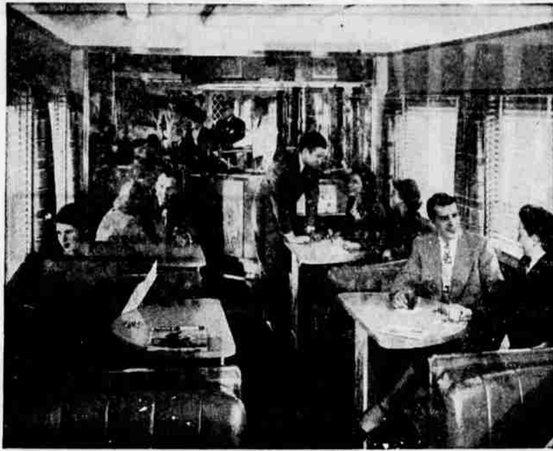
Interior View, Tavern car, Southern Pacific's streamlined Shasta Daylight to go into service between Portland and San Francisco, July 10.