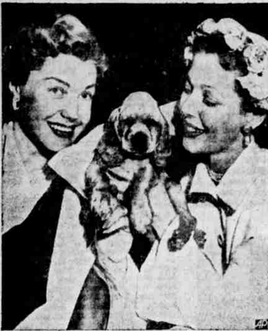
Film Star Buys Puppy —Loretta Young (right), film actress, bought herself a Cocker puppy for $75 at a Beverly Hills, Calif., auction which she sponsored. The proceeds were for the benefit St. Anne's Maternity Hospital for unmarried mothers. Shown with Loretta and the puppy is Esther Williams, film actress.