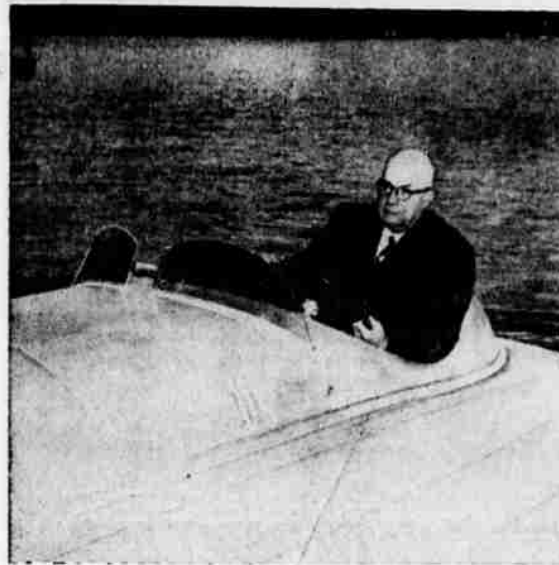
Kaiser Speedboat Henry J. Kaiser, auto builder, sits in his "Aluminum Star" which Guy Lombardo will attempt to pilot to a speed record at Lake Placid, N. Y.