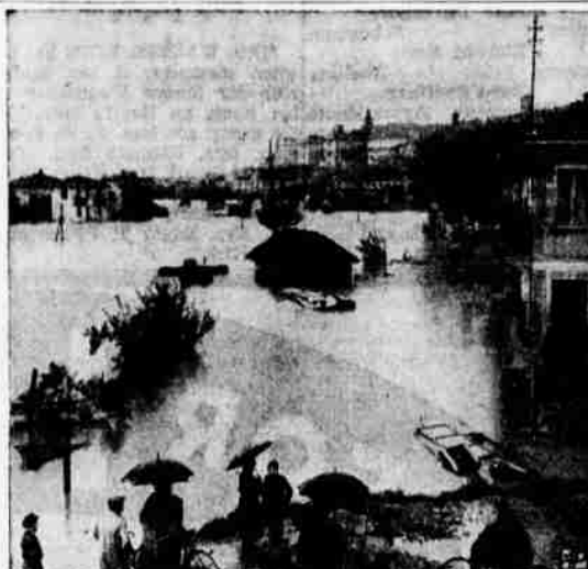
Rain Follows Drought—Prolonged drought in the Turin area of Italy was followed by rains and floods.

Monday morning she arrived at Grant high school an hour and 40 minutes late for class and was ordered to stay after school for discipline.