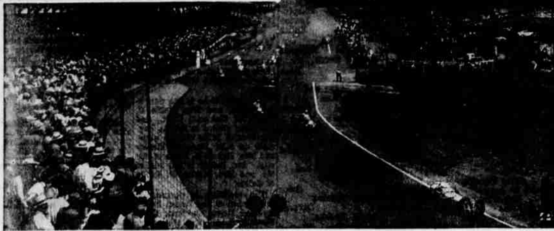
Scene of 500-mile Grind—Rex Mays leads the field to the first turn in the 1948 Memorial Day 500-mile race at the Indianapolis Speedway, won by Mauri Rose. The traditional classic will be held for the 33rd time May 30, Memorial Day.