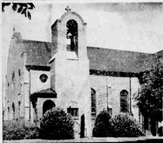
Church Observes Jubilee —The 50th anniversary of St. Luke's Catholic church in Woodburn will be observed Sunday. The parish was established in 1899 with the church erected in 1933 and the first mass held on Christmas of that year. Dedication was in May, 1934.