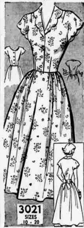
3021 SIZES 10-20

"That's my old shivers when I think of that day."