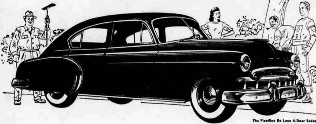
The Fleetline De Luxe 4-Door Sedan. White sidewall tires optional at extra cost.

This Spring...it seems everybody's fancy is turning to the most Beautiful BUY of all