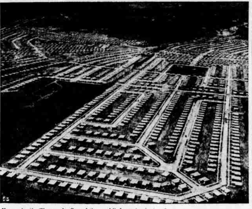
Houses by the Thousand-One of the world's largest private housing projects is near San Juan, Puerto Rico, where 3,500 homes are occupied and 1,500 more are under way.