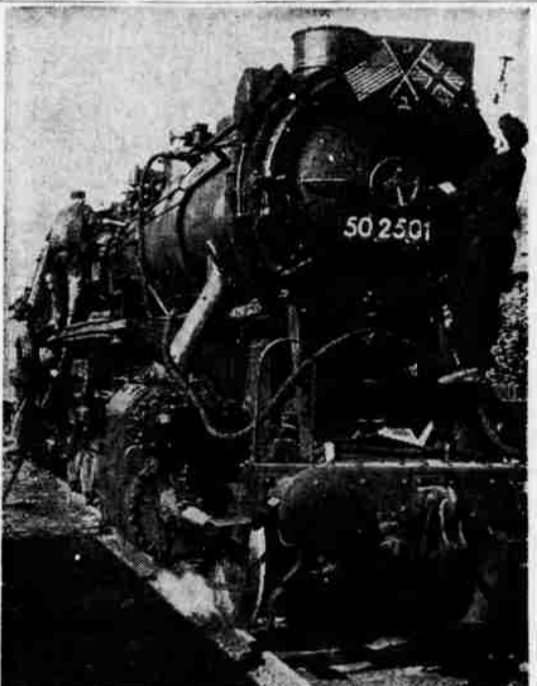
Prepare for Blockade End —Railroad man decks a locomotive in Berlin with a sign which is painted the American and British flags, as the engine is prepared for operation with the end of the Berlin blockade. Other workmen in the Gruenwald railroad yard put the finishing touches on the engine.

Warner Motor Co. "Your Lincoln-Mercury Dealer" 430 No. Commercial Dial 2-2487