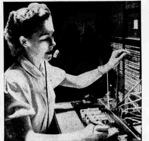
3. In the quiet hours of the night operators handle relatively few calls... but many of them are vitally important. Repairmen are on call for service on important lines...doctors, hospitals and the like. Garagemen check and equip trucks for the next day's installation rounds. Building service workers make offices spic and span... all a part of providing good, reliable service to you.

4. You can help yourself get the most from your telephone...a servant that is constantly growing in value. You can do it by using the telephone in the most efficient way: being sure of the right number before you call... giving the called person plenty of time to get to the telephone... spacing your calls so others may get a call through to you.