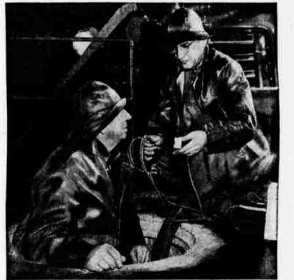
1. Darkness can't stop these telephone men as they begin an important emergency cable repair at night. Fortunately, these emergencies are not common... usually can be repaired in daylight. But, up and down the Coast, other telephone people burn midnight oil regularly...so your telephone will work for you when you want it.

Hundreds of telephone people in the West keep night patrol to help meet emergencies and keep service reliable