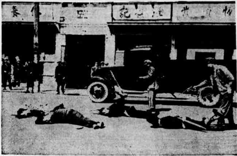
Shanghai Police Wage War on Gangsterism —In a determined effort to rid Shanghai of crime, Municipal police execute five gangsters which victimized residents of various parts of the city. A total of 25 persons were executed in two days in this city facing imminent communist siege. Red advances and war jitters have prompted an increase in the city's crime.