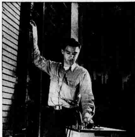
2. One important night-time job is done by this electronic tester. It checks lines to make sure they're in good shape. At the same time, other telephone men are vacuum cleaning and inspecting sensitive switching equipment... you might say it's stopping trouble before it starts. And night is the best time to do it, while most telephone users are sleeping.