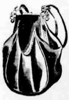
Accessories, main floor

An array of handbags that make sleek partners for spring suits and summer dresses. Calf, plastic patent simulated suede, straws in fashionable new styles. White, green, red, blue, blonde, navy, black.