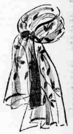
Accessories, main floor

Fresh as the first bud of spring are these hand-painted scarfs of sheer, sheer silk chiffon. Flattering shades of pink, blue or white with delicate floral designs are a sentimental gift seasoned with sense. In longer style with soft, rolled hems.