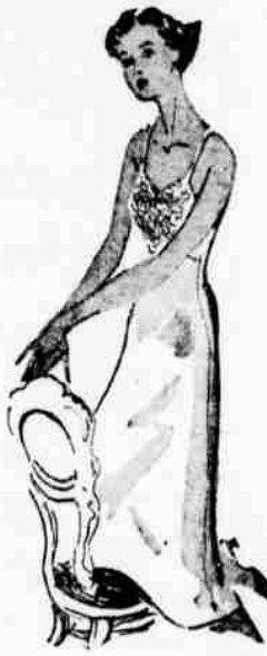
Lingerie, main floor

Lace-laden lingerie priced sweetly low at Roberts! Fine quality slips meticulously tailored for a sleek, smooth fit. Tearose, blue, or white in marvelous multifilament rayon crepe. Either deep lace yoke or lace bodice. Sizes 34-40.