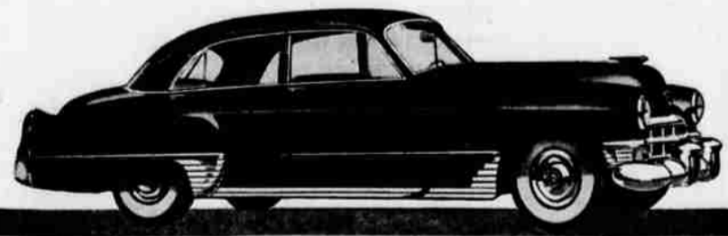
White sidewall tires available at additional cost.

The man who wants a finer motor car than the 1949 Cadillac, will have to wait.