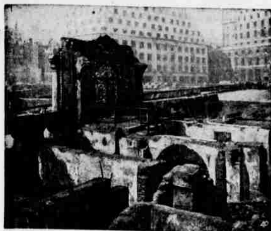
Underground Ruins revealed by the blitz in London