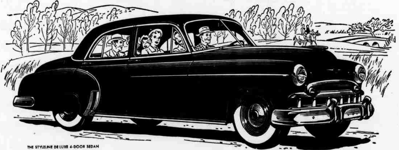
THE STYLELINE DE LUXE 4-DOOR SEDAN White sidewall tires optional at extra cost