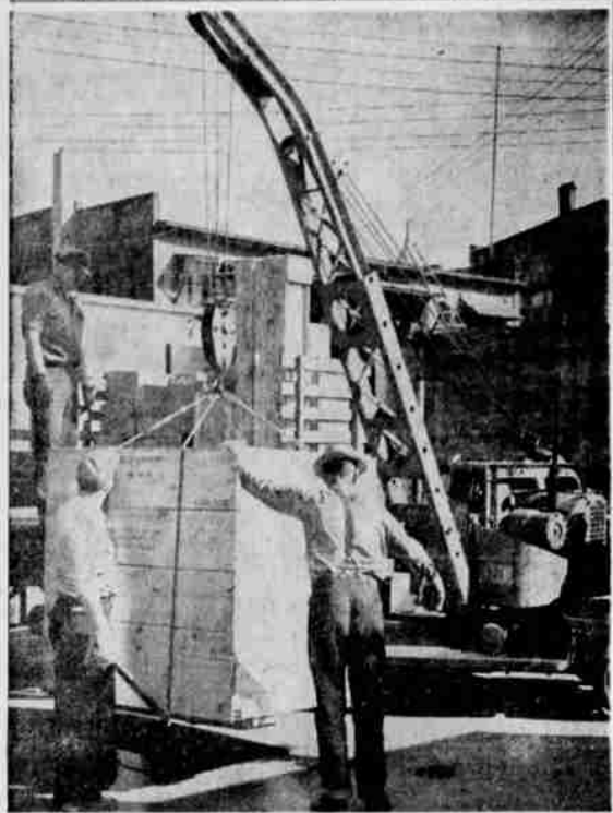
More Equipment for a Growing Capital Journal—Crated parts of a new Linotype machine are shown being hoisted into the Capital Journal building. The additional line-casting machine, which helps set the type that goes into the newspaper, will be in operation by the end of the week to handle its share of the load of giving the Central Willamette valley a better newspaper.

Dimensions—4' x 8' in three thicknesses—1/8", 3/16", 1/4"