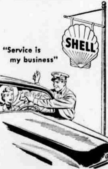
"Service is my business"

Shell splits molecules! Shell scientists take the finest available crude—activate the molecules by splitting them and rearranging the atoms according to Shell's formula for a perfectly balanced gasoline. The result—Shell Premium, the most powerful gasoline your car can use!