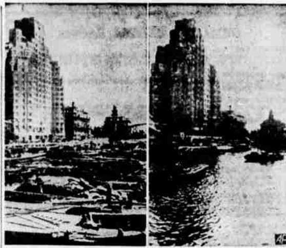
Before and After—Soochow Creek, Shanghai, normally crowded with sampans and various small craft, is shown at left with the Broadway Mansions in the background. At right is the same scene after the authorities ordered the river cleared as a precaution against sabotage.