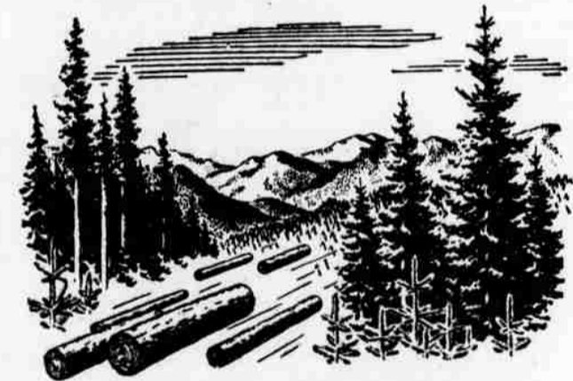
—AN ENDLESS SUPPLY OF LOGS FROM TREE FARMS.