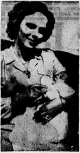
Princess and Daughter — Princess Anne of Bourbon-Parma, wife of ex-King Mihai of Romania, holds their daughter, Princess Marguerite, at their home, "La Petite Grangette" (The Little Barn) at La Conversion, near Lausanne, Switzerland. Princess Marguerite was born March 26.