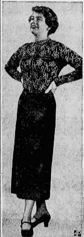
Young Sophisticate—Bandmaster braided jacket dresses up a date outfit.