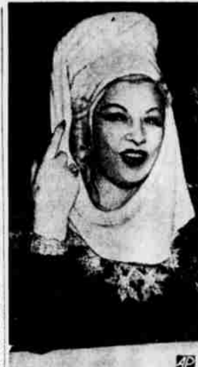
Turban — Actress Mae West wears a draped turban with a face-framing scarf at a night club in Hollywood.

Matter of fact, if Riley weren't so busy fixing cars and hadn't taken time out to build a