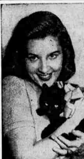
Pet Cat — Actress Barbara Bates doesn't seem to be afraid that Toby, the black cat, will bring her bad luck.

Dipper On Move Low above the northern horizon, the familiar Big Dipper is