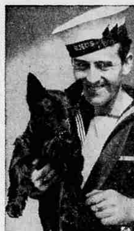
FRIENDS —Fala, pet Scotie of the late President Roosevelt, makes friends with a Canadian tar at Campobello Island, N. S., near the Roosevelt Canadian summer home.