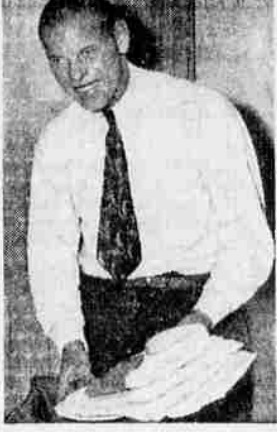
Ivory Hunter—Babe Herman who achieved fame as a hard hitting and hard headed outfielder for the Brooklyn Dodgers, recently gave up his California turkey ranch to hunt baseball players for the Pittsburgh Pirates. "Finding baseball players is a lot easier than finding feed for turks," the Babe declares.