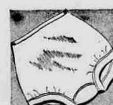
BEAU DURA PANTIES FOR GIRLS 35c Sizes 4 to 10. Of cotton that's famous for its long wear and run resistance.