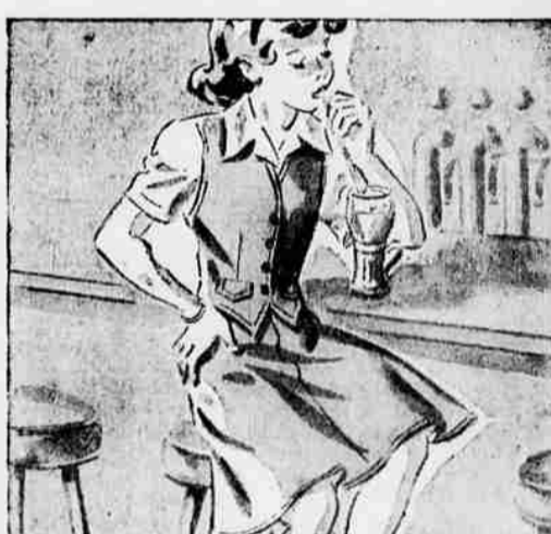
GIRLS' JERKINS IN THE STYLES THEY PREFER 3.98

Sizes 7 to 14. Ideal for all kinds of wear and sturdy enough to take a lot of hard knocks. Lots of favorite classics with pleats and gores. Plaids, plains.