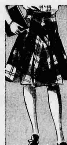
SMART SKIRTS FOR SCHOOL, DRESS, PLAY 3.98

Any boy would go for this handsome new jacket! Rugged caps, lined with warm plaid. Zip front, two front pockets and map pocket. Adjustable cuffs. 8-18!