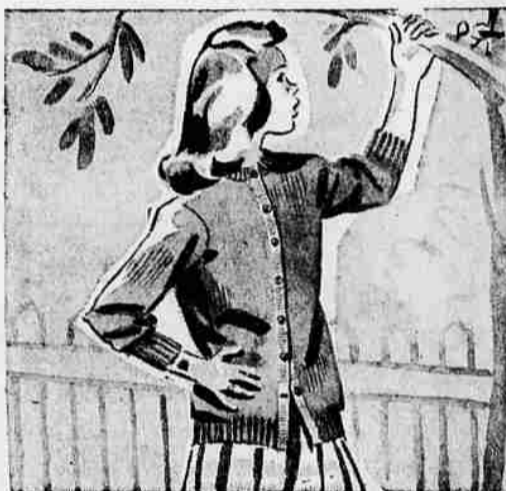
GIRLS' ALL WOOL CARDIGAN CLASSICS 3.98

Sizes 4 to 10. He'll feel as though he's ready for high school campus in one of these! Rich brown or teal wool fleeces, other side—cotton gabardine.