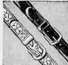
DRESS OR SPORT BELTS FOR BOYS 49c For his back-to-school wardrobe. Embossed western styles and smooth grain leathers!