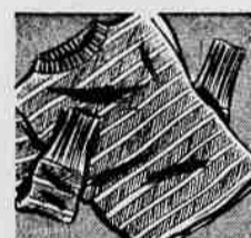
COTTON KNIT SHIRTS FOR BOYS 1.39 Sizes 10 to 14. For play, for school, for dress up, too. Soft, long wearing knit. Stripes.