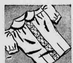
GIRLS' GOOD-LOOKING BLOUSES 1.98 Pretty tailored and dressy styles in lovely rayons, serviceable cottons. Cut to fit well.