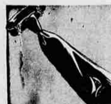
READY-TIED TIES FOR JUNIOR BOYS! 1.00 Smoothly-knotted—just like dad's! Handsome, colorful patterns in a real sturdy fabric!