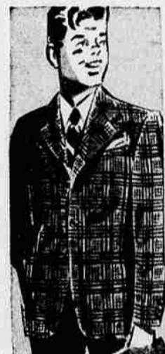
SMART WOOL SPORT COATS FOR BOYS 10.98

Built for active living... these are toughies that can stand a punishing pace (the kind they'll get at school and play!). They are fully cut and tailored like men's in sizes for boys! The soft finished fabrics have stamina built right into them. New plaid, herringbone and diagonal patterns... the kind that team up swell with sweaters, jackets and sport coats. Sizes 8 to 18!