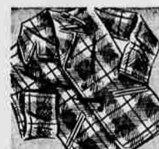
SMART PLAID JACKETS FOR FALL 3.98 Plenty of warmth—85% new wool, 15% wool-and-mohair. Well tailored. Ass. colors.