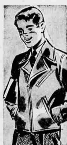
STYLED LIKE A PILOT'S IN SMOOTH CAPE SKIN 10.45

They're your favorite turn-abouts... button them up the front, or button them down the back! And smooth is the word for the way they fit, for those luscious colors—vivid and pastels. Knit of 100% new wool with matching color gros-grain ribbon trimming the front button opening. Snug ribbing at cuffs, neck, and waistband. Sizes 7 to 14.