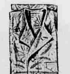
PAJAMAS IN SOFT RAYON COTTON FLANNEL 2.79 Fully cut coat or pullover models! Complete comfort!

Sizes 7 to 14. All time favorites with the grammar graders! Yes, young as they are, they're pretty definite about the importance jerkins play in their active school and after school hours. They know that these nifty styles in warm, long wearing wool and rayon are really something to talk about. And too, they appreciate the sturdy tailoring, comfortable fit, casual simplicity.