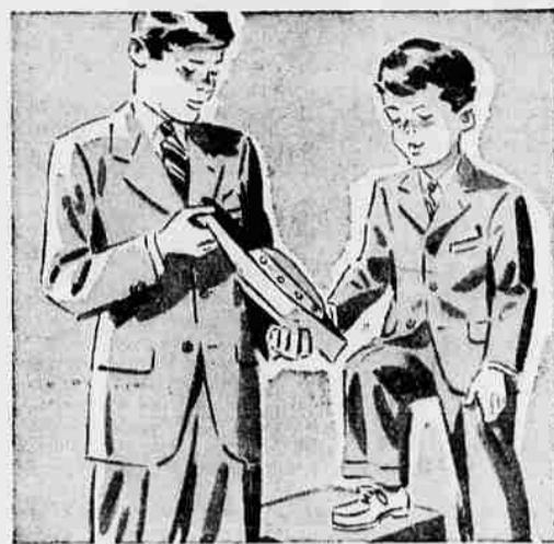
WARDS HANDSOME ALL WOOL SUITS FOR BOYS 10.98

Sizes 4-10. What sets this suit apart from the others as a really outstanding value? Well, for one thing it's the way it looks—and that includes the smart style, the neatly finished seams, the rich blue and brown tweeds. For another, it's the sturdy feel of the rich all wool it's made of. And equally important, are its unseen qualities—expert cutting and tailoring.