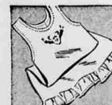
BUILT-UP RAYON SLIPS SIZES 2-14. 65c They wear well, they launder easily. Hemstitched at neck and armhole. Ample cut.