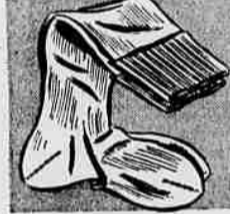
GOOD-LOOKING BELOW THE KNEE HOSE 29c Finely woven cotton with snug fitting tops. Sturdy as can be. Very absorbent. 1/2 to 1/2.