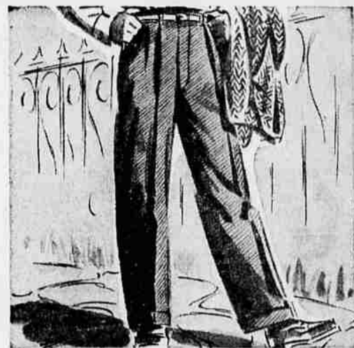
THESE SCHOOL TROUSERS ARE TOPS FOR WEAR! 4.98

Sizes 4-10. What sets this suit apart from the others as a really outstanding value? Well, for one thing it's the way it looks—and that includes the smart style, the neatly finished seams, the rich blue and brown tweeds. For another, it's the sturdy feel of the rich all wool it's made of. And equally important, are its unseen qualities—expert cutting and tailoring.