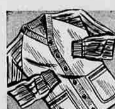
STURDY COAT SWEATERS FOR SCHOOL 2.98 to 3.98 20% wool, 80% cotton means warmth! Smart fabric front, knit back, sleeves. Assorted colors.