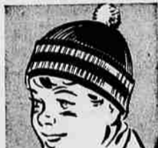
100% VIRGIN WOOL NAVY CAPS 79c A grand cap for that energetic youngster of yours! Warm and snug-fitting. Assorted colors.