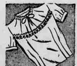
GIRLS' PRETTY COTTON BLOUSES 1.69 Sizes 1 to 6x. Tailored, ruffled and peasant types. In fine cotton that launders well.