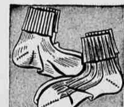
WARDS STURDY COTTON ANKLETS 20c Firmly knit in every color you can think of. Ribbed cuffs—some elastic tops. 8 to 8 1/2.