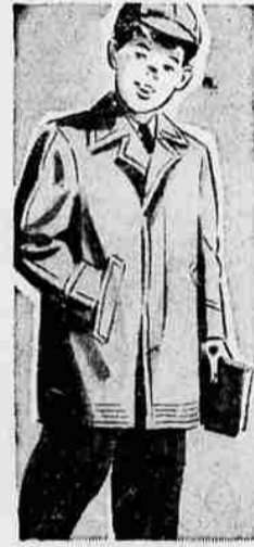
BOYS' REVERSIBLE FINGERTIP COATS 9.98

Great favorites—for school, for informal dress wear, for casual sports! In handsome glen plaids, window panes, diagonals, solid herringbones.