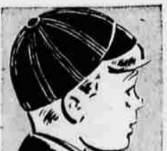
AUTHENTIC ETON STYLE FOR BOYS! 1.49 Handsome caps for school or dress wear. Rayon lined, with cotton fleece lined ear flaps!