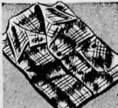
COTTON FLANNEL SHIRTS FOR BOYS 2.58 Two-toned, softly napped, medium weight. Long sleeves, square in-or-out bottoms.