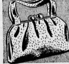
FALL HANDBAGS FOR GIRLS plus 20% 1.69 Smartly styled in rich looking simulated leathers. Roomy, souches, top straps, envelopes.