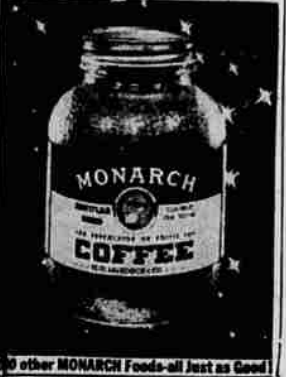
Other MONARCH Foods—all Just as Good

The new Acousticon Speech-Hearing Test will be given free as well as a private demonstration of the new Future Acousticon hearing aid, which is made by America's oldest hearing aid manufacturer. Simply call at the time mentioned above. Evening appointment for a demonstration in your own home may be arranged for. (Adv.)