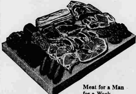
Meat for a Man for a Week

Here is a typical week's supply of meat served to patients of the Convalescent Hospital of the Army Air Forces at San Antonio—one of 12 such hospitals in the United States. Meat is served three times a day. The week's assortment shown above includes fresh pork, beef, lamb, ham, bacon, liver, frankfurters and cold cuts.