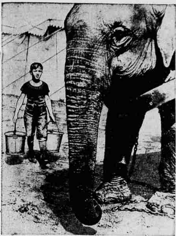
A Picture That Never Grows Old—Carrying water to the elephants has been one of the sacred prerogatives of the American boy since Tom Sawyer's day and there are few grownup boys of the present time who can view a scene such as this without a touch of nostalgia.