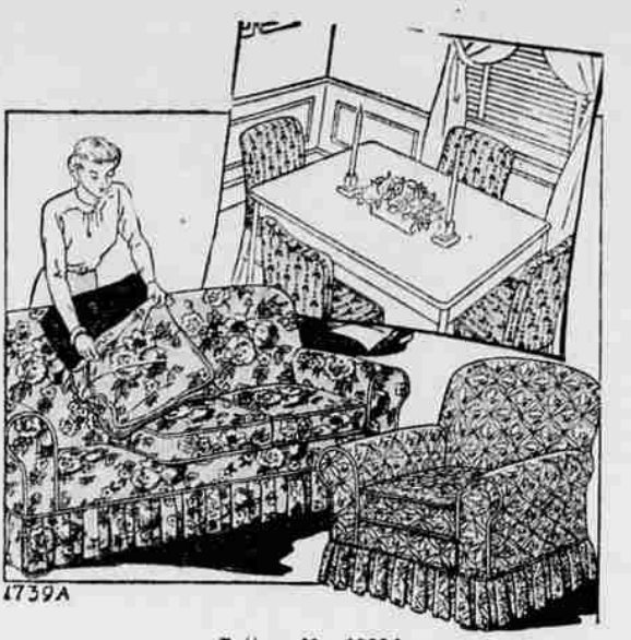
Bright and Cheerful—Furniture problems are forgotten with this quick change. These easily made covers are grand protection for your best, or snappy pickups for old pieces.

Pattern No. 1739A Our 60-page multicolored book of Needle Arts containing five free patterns, and many other suggestions for dressing up your home and yourself is now available. Send your request for this book to the address listed below, enclosing twenty cents (20c) in coins to cover the cost and mailing charges.