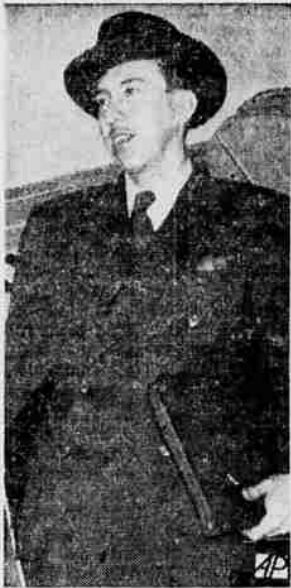
Delegate (P)—Foreign Minister Guillermo Toriello Garrido (above), of Guatemala, the first foreign diplomat to arrive for the United Nations conference, as he left his plane in San Francisco.