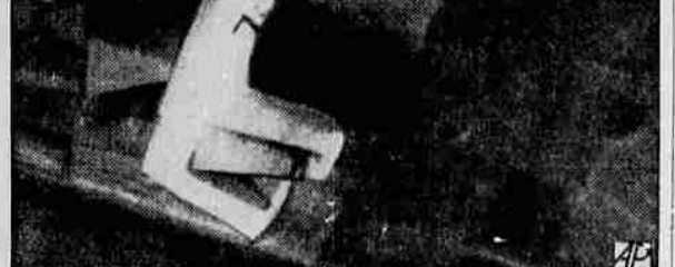
Yank Bomber Is Shot Down (AP)—A B-26 Invader bomber of the Ninth bombardment division plunges earthward somewhere in the European theater after a direct hit by enemy flak has sheared off the left wing. Bombs are still in the bomb bay. The plane was hit seconds before the scheduled release of its bomb load. (AP wirephoto from army air forces.)

He stated that Oregon-grown bulbs are now judged superior to the Japanese varieties imported before the war.