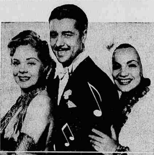
Alice Faye, Don Ameche, and Carmen Miranda are the tuneful trio in "That Night in Rio," in Technicolor, at the Hollywood theatre tonight with "River's End."

MASTER Bread Popular... because it's Good!