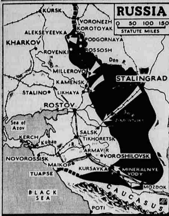
Russians Advance in South—Black section of map indicates approximate territory the Russians had regained from Germans on the front stretching from Voronezh to the Caucasus...

Where such opposition might come from is not clear; it had been supposed that the current cabinet, composed of five generals or admirals, including Tojo, and eight undistinguished civilians, was completely subservient to military direction.