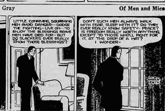
Of Men and Mice