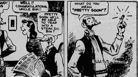
Bin Has a Toothache in His Finger