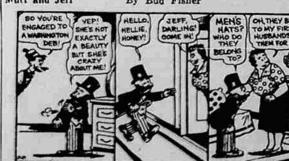
Mutt and Jeff