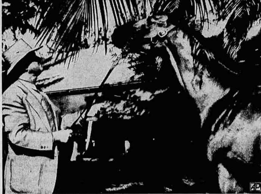
Whirlaway Will Be Racing All Next Year—Trainer Ben Jones announced at Miami, Fla., that Whirlaway, now at Hialeah Park, winner of more money than any horse in racing history, will be running all next year. Whirly's only reaction to the news was to reach up for a nip of palm leaf. Here Jones seems to be explaining the announcement to the famed race horse.