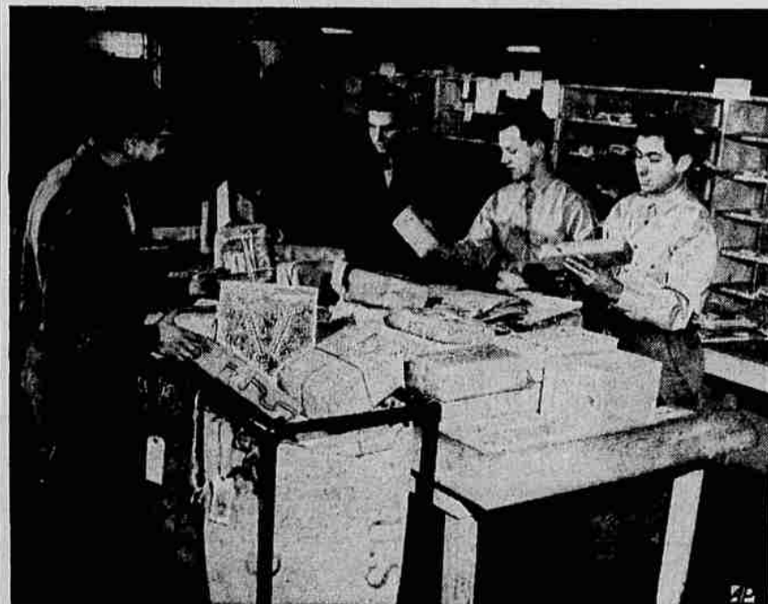
Army Post Office Is Busy Place—At this time of the year the army post office serving overseas mail from San Francisco, as with others, is pretty well loaded down with Christmas gifts. Enlisted men shown here are routing parcel post, which, in the period from Oct. 1 to Nov. 6, totaled 76,087 sacks.

The yucca plant, which grows in the southwest, is being studied as a possible substitute for imported hemp and jute.