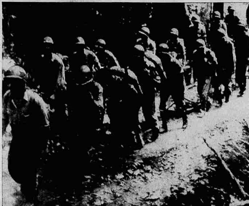
Marines Move Up to Attack Japs on Guadalcanal—United States marines move through the tropical jungle of Guadalcanal island to get into position to attack Jap forces entrenched on the Matanikou river. This picture was radioed from Honolulu to San Francisco.

A 9 p.m. curfew has been imposed on the area, it was said.