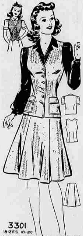
3301 SIZES 10-20

Maccabees of Capital lodge No. 84D will meet at Olinger park Thursday evening for a 6:30 o'clock no-host picnic supper. Members attending are asked to bring their own table service and the lodge will furnish coffee and watermelons.