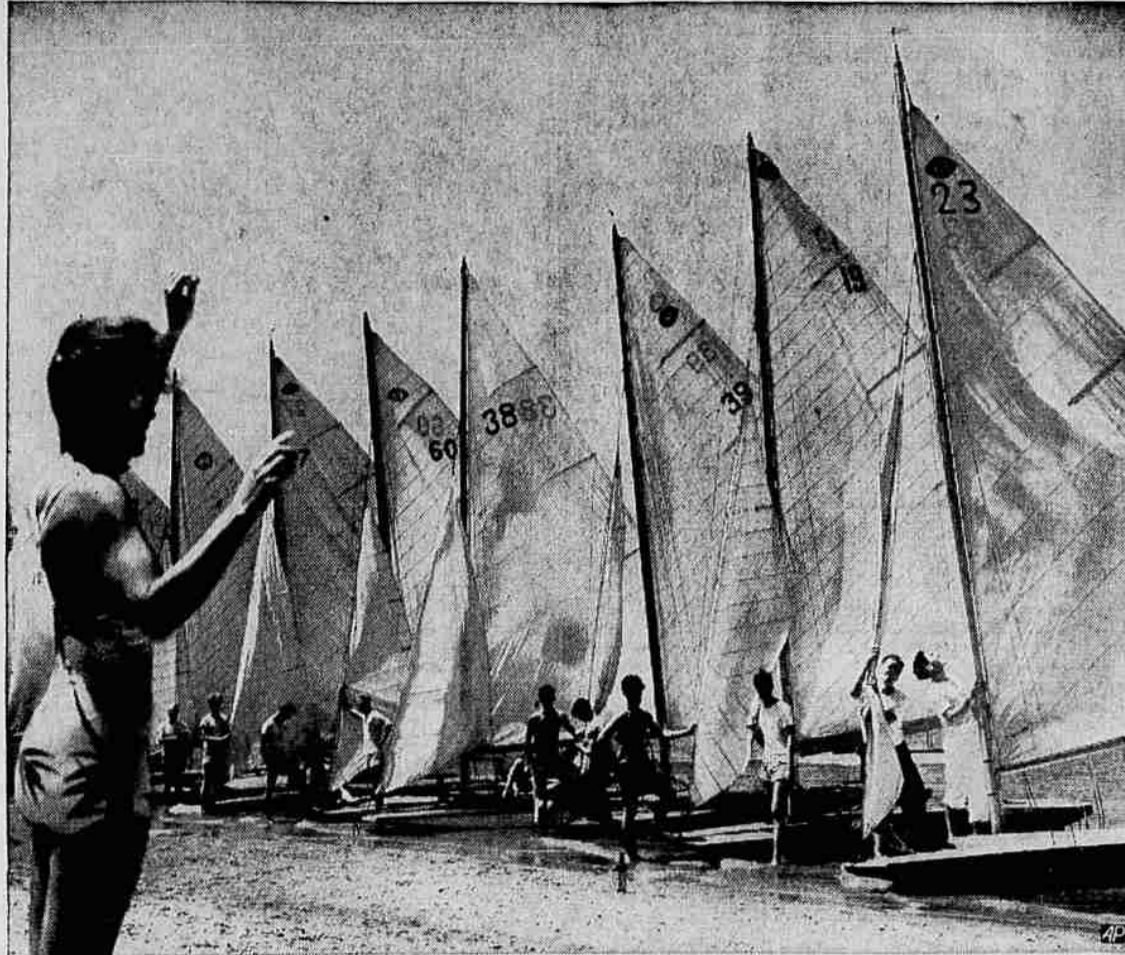
UP SAILS! —At the signal young skippers "up sails" as they prepare for a regatta at Alamitos Bay, Long Beach, Calif. Salty skippers, young and old, from all parts of Southern California, took their small sailing craft to Alamitos Bay for a series of races.

"But I concede to counsel that I don't believe the constitution of the United States is so unsuited for survival in these days of lightning war that if we need to protect critical military areas we can only do so by the slow process of constitutional amendment."