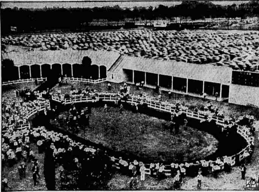
Autos, Autos, Autos, and Horses—More than 20,000 persons found their way to the new $1,750,000 Garden State horse racing park at Camden, N.J., for its formal opening in spite of transportation difficulties. Here horses parade in the paddock before the first race. Part of a jammed parking lot is seen in the background.