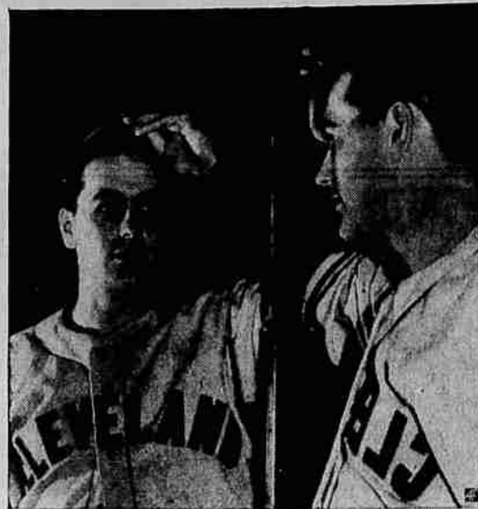
GOOD LUCK TO YOU! —Lou Boudreau, boy-manager of the Cleveland Indians who signed a two-year contract last November—he was 24 at the time—wishes his mirrored image a good season. This youngest manager in major league history succeeds Roger Peckinpaugh, who's now general manager.