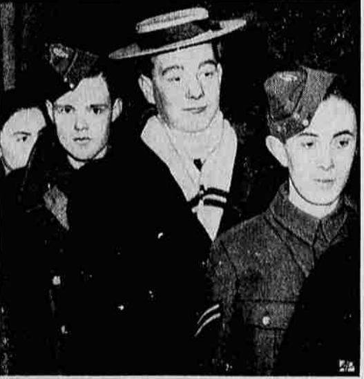
SCHOOL TIES-In his customary boater (hat), a lad from exclusive Harrow school lines up with less-schooled seventeen-year-olds at a labor exchange in London, to register under new conscription law. Harrow had its boys register at these labor exchanges, as an example to other British public schools, which had sought special facilities. Boy alongside is a Home Guard.