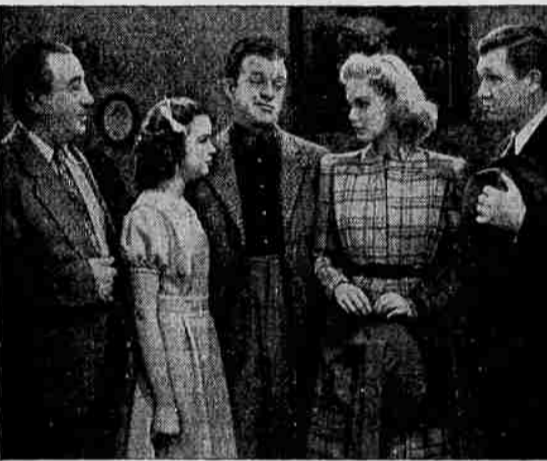
Comedy Flavors Drama—This describes the scene from "A Little Bit of Heaven." The players are, left to right, Hugh Herbert, Gloria Jean, Frank Jenks, Nan Grey and Stuart Erwin. The companion feature for the three-day run starting tomorrow at the Liberty theatre is "Mexican Spitfire Out West," starring Lupe Valez and Leon Errol.