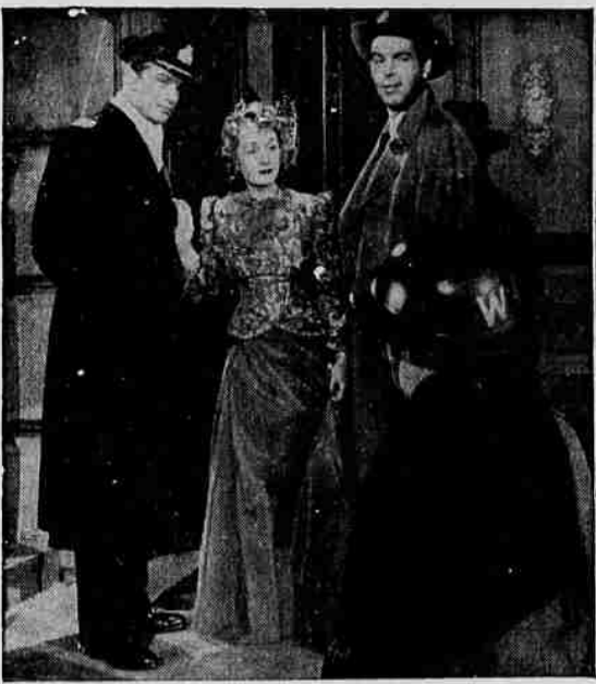
"All Clear" For Love And Laughter—An air-raid warden in bomb-battered London gives the "all clear" signal to this trio from the exciting comedy-romance "One Night in Lisbon," opening Sunday at the Elsinore theatre. Left to right are John Loder, a captain in the British navy; Billie Burke, American society woman residing in London, and Fred MacMurray, Yankee pilot who ferries bombers across the Atlantic.