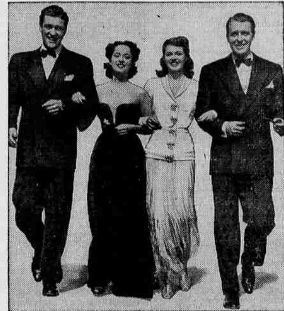
Affectionately Yours For Fun—Dennis Morgan, Merle Oberon, Rita Hayworth and Ralph Bellamy in their romantic comedy "Affectionately Yours," opening today at the Capitol theatre. The companion film, "Lone Star Raiders," features the Three Mesquiteers.