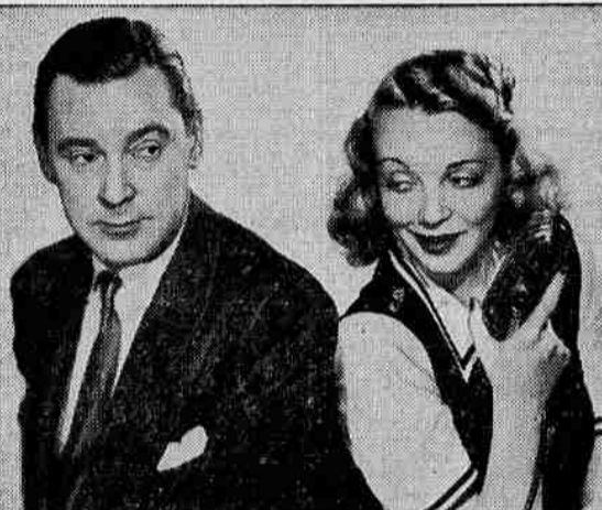
Telling The World—One way is by microphone as Virginia Bruce does here in "Adventure in Washington," now at the Grand theatre. Herbert Marshall, her co-star, is seen as a United States senator; Virginia, as a radio reporter, keeping up with the dramatic tempo of history in the making. Young Gene Reynolds, new boy star, is featured.