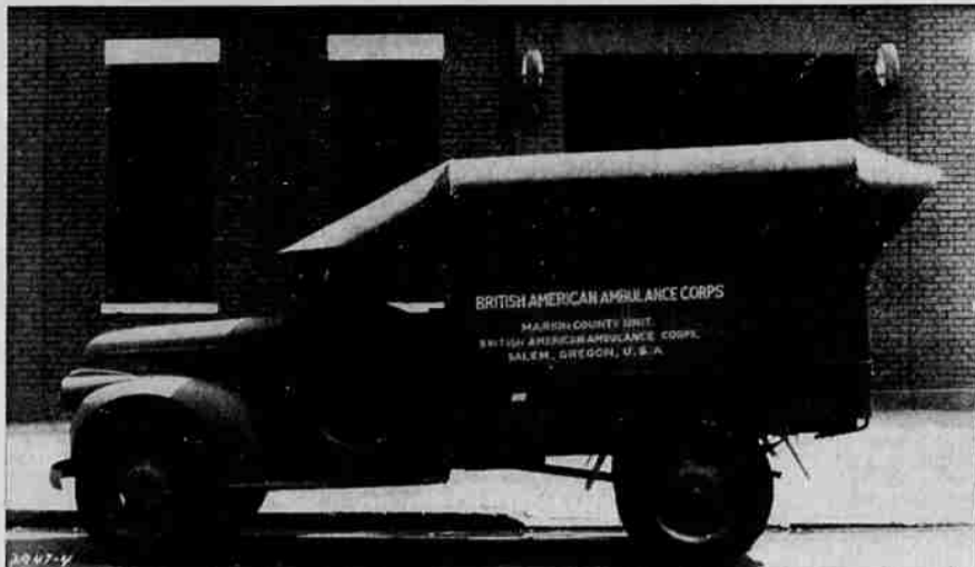
Marion County Contributors to the British war relief fund provided the $1350 that paid for this ambulance. The balance of $2275 raised here went for the purchase of vitamins and medical supplies for shipment to England.